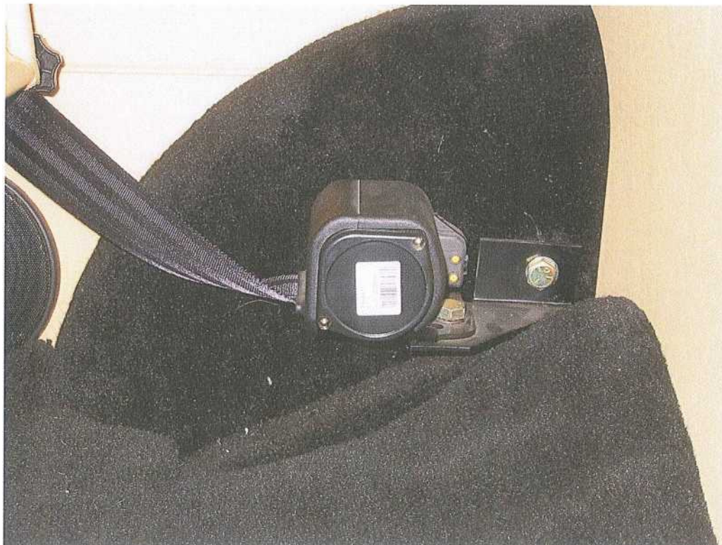
RIGHT HAND SEAT BELT