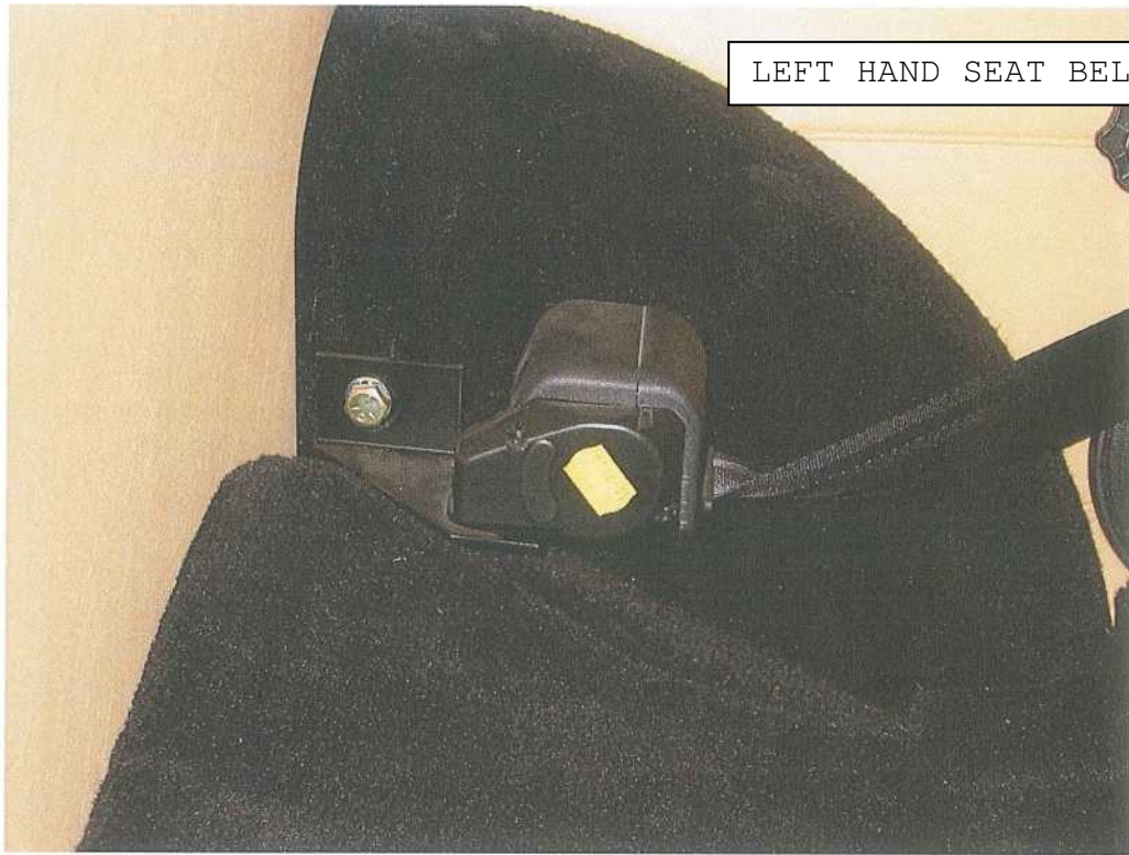
LEFT HAND SEAT BELT