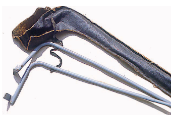
TONNEAU COVER STICKS BAG