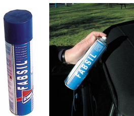
FABSIL WATER REPELLANT