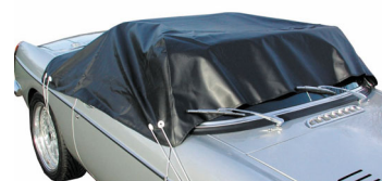
STORM COCKPIT COVER MGB & MGC