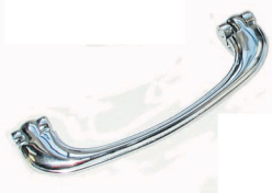
CHROME DOOR PULL MGB 1962-71 & MIDGET