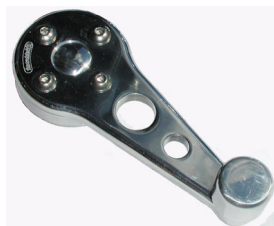
ALLOY WINDOW WINDER HANDLE (EACH)