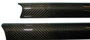
CARBON FIBRE DOOR CAPPINGS MIDGET