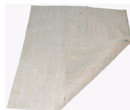
CALICO WEBBING COVER (EACH)