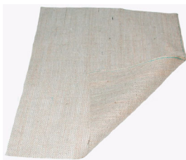
CALICO WEBBING COVER (EACH)